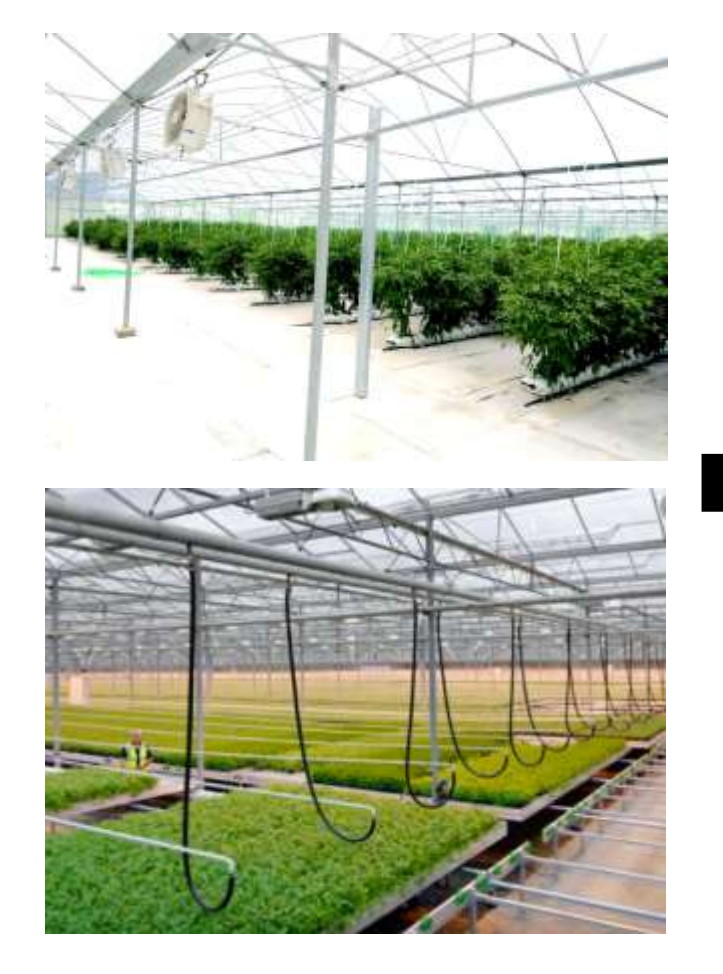
Large-Scale Modern Greenhouses